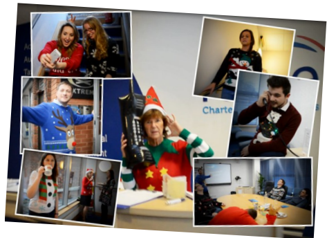
This was our Mannequin Challenge Christmas e-card for which we donated print and postage savings to the Pancreatic Cancer Research Fund.