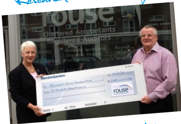
One of a few big cheques for the Pancreatic Cancer Research Fund

We have since raised over £4000 for the charity and our staff continue to remember with fondness our colleague and organise regular Fundraising activities.