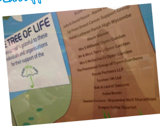
Our efforts were recognised by Scamappell in a Tree of Life