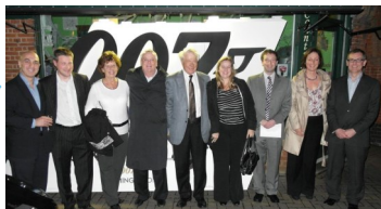
We were neither shaken nor stirred after our James Bond fundraising